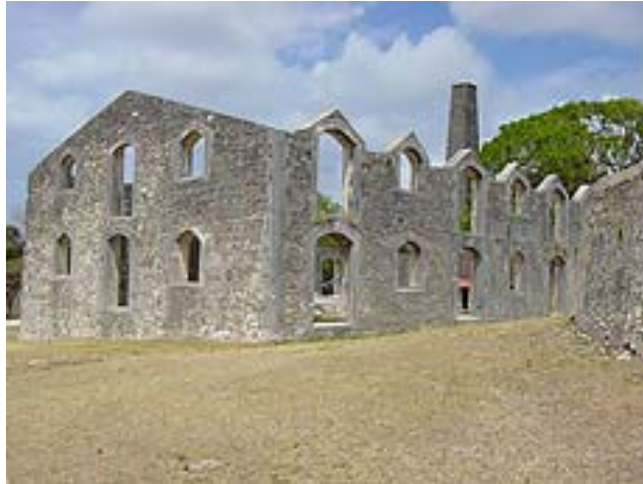
The Murat Plantation, Marie-Galante, Guadeloupe.