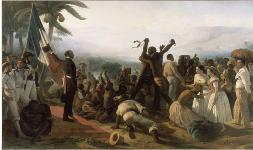
François-Auguste Biard, “The abolition of slavery in the French colonies in 1848”, commissioned painting, 1848-1849, National Museum of the Château de Versailles. The slaves watch their chains being broken; they express joy and gratitude to the general commissioner of the Republic, who stands in front of the French republican flag holding the abolition decree. Behind him, sailors represent colonial trade with its promise of prosperity. The planters are among the crowd of freed slaves, symbolising recommendations to “forget the past” issued by the colonial authorities and candidates standing for election as colonial parliamentary representatives.