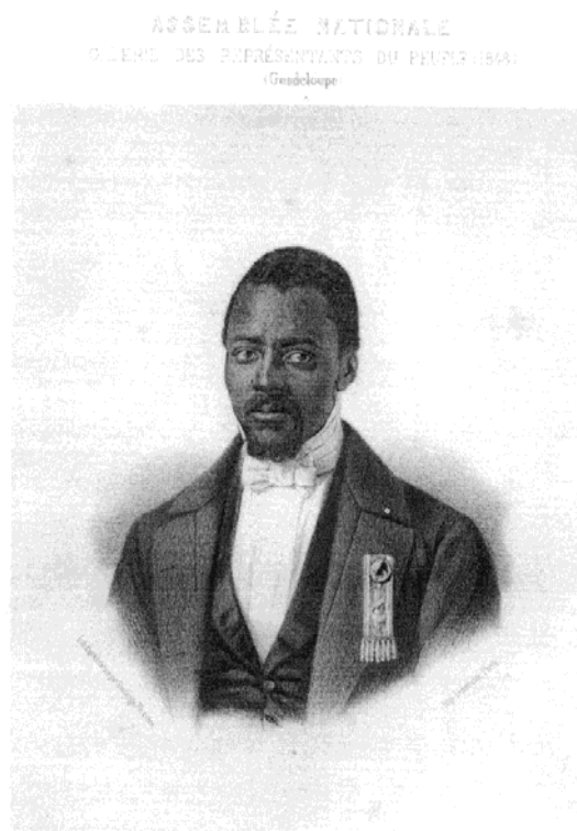
Louisy Mathieu, former slave, elected representative of Guadeloupe to the National Assembly in 1848, under universal (male) suffrage, within the ranks of the “Schœlcherists”.

Alongside the development of mythical interpretations of history that were peculiar to the French Caribbean colonies, a most unusual policy was implemented, which involved deliberately forgetting about the past and driving memory into a particular mindset. The scale of the process initiated in 1802-04 when slavery was re-established changed markedly from 1848 onwards. It was for the sake of “social reconciliation” between former slaves and their masters that, just after emancipation in 1848, the administration and all candidates seeking parliamentary representation expressly advocated “disregard for the past”. This expression crops up in professions of faith drafted by candidates of every conceivable persuasion during the legislative elections of 1848 and 1849.