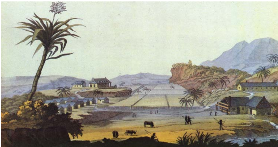
A plantation in a colony in the Caribbean. Italian engraving, 1820.

recently acquired by the French National Archives (see Schmidt in the bibliography). This is why the descriptions regarding the work, the production techniques used on these plantations, and the living conditions or punishments suffered by slaves, which were published by travelling observers and missionaries in the eighteenth and nineteenth centuries, have done relatively little to further our knowledge of the daily lives of slaves. Under such circumstances, demographic data are more akin to assumptions and theories than findings from calculations based on plentiful and reliable data.