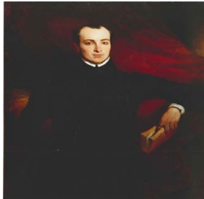
Victor Schœlcher, by Decaisne, 1832.