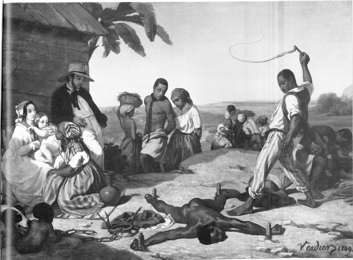
Marcel Verdier, “Punishment of the four stakes”, Menil Foundation, Houston, Texas. This painting was refused by the Salon du Louvre (Paris) in 1847, as potentially provoking public “hatred of slavery”... (Archives of the Louvre Museum, “Les Salons du Louvre”, Paris).

Historians possess a set of descriptions – and sometimes direct testimony on the part of observers who visited the region – about the physical and moral violence to which slaves were subjected. Proceedings on grounds of illegal cruelty, which were instituted against slave masters or those who ran their plantations, became increasingly frequent in the 1840s. The resultant reports provide historians with clearer and firmer information about the conditions for survival among slaves and the relations that developed between plantation masters and the colonial authorities. While the process of discrimination and social exclusion imposed on slaves – and on “free people of colour” – is becoming better known, fresh investigations should lead to a more accurate perception of what really happened. Judicial sources and items of correspondence concerning matters brought to court have not yet been subject to special scrutiny.